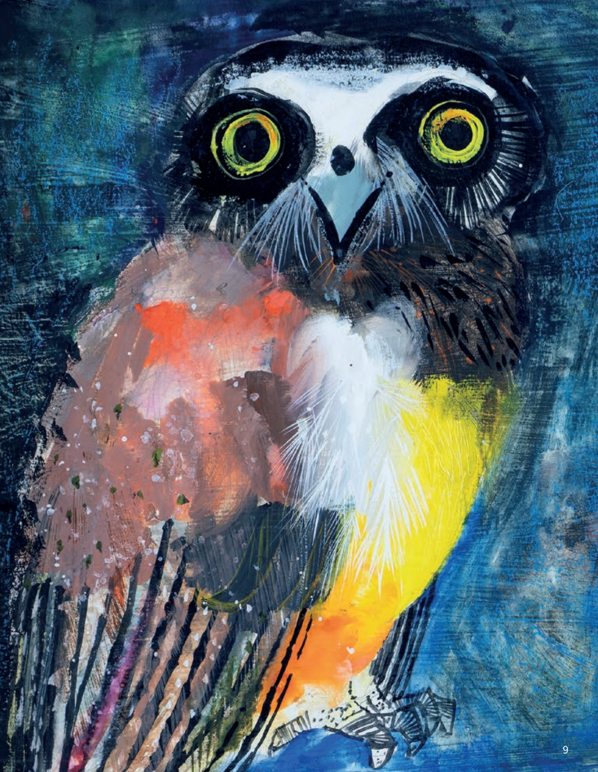
Image credit: A stare of owls – paws, claws, tails and roars © The Brian Wildsmith Estate, 2024. Reproduced with permission of The Brian Wildsmith Estate and Oxford University Press.

For the first time Brian's personal collection of over 40 colourful original illustrations, early works, drawings and paintings will be on display in the beautiful setting of the Cooper Gallery. The walls will be filled with colour and vivid characters. It's a perfect destination for art lovers of all ages and our younger visitors can enjoy our specially created forest activity area 'Brian's Wild Wood', upstairs in the Sadler Room.